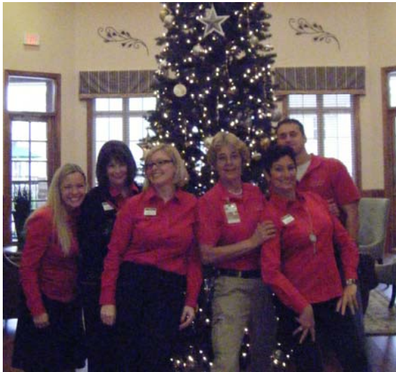
Springs at Effingham Staff