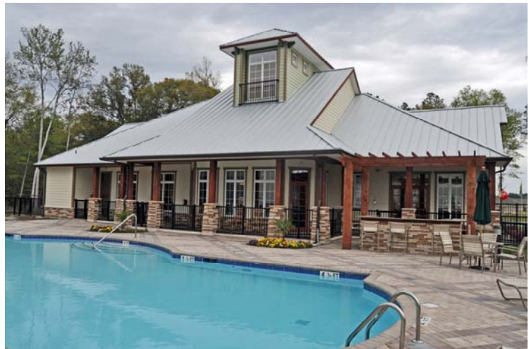
Clubhouse at Springs of Effingham