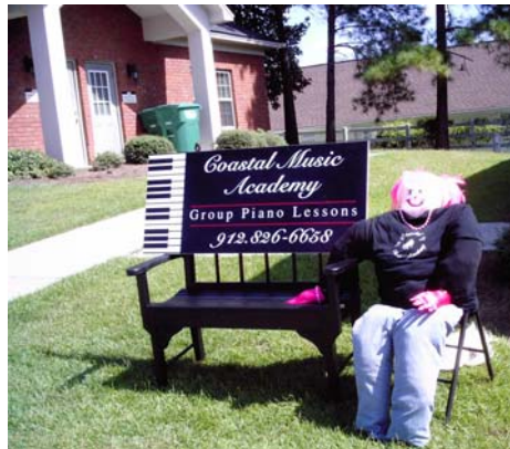
Coastal Music Academy